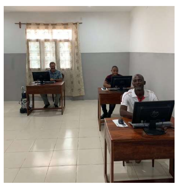
The school centre at Inhamizua