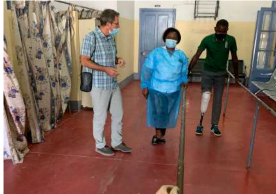
The orthopedic center